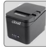
High Speed Printing