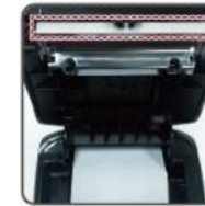
Ceramic Auto Cutter